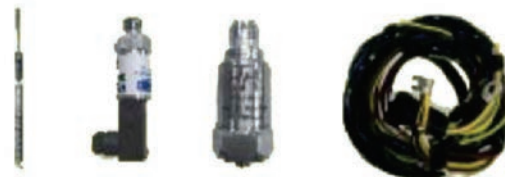
Thermocouple, Pressure Transmitter VIB Sensor, Wiring Harness